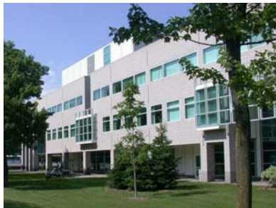
Pavillon Desjardins (where the event will take place)